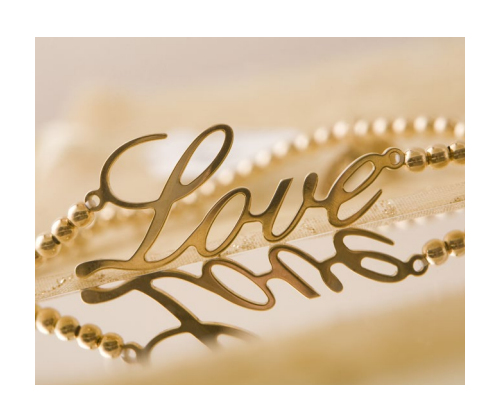
Fine metal cutting