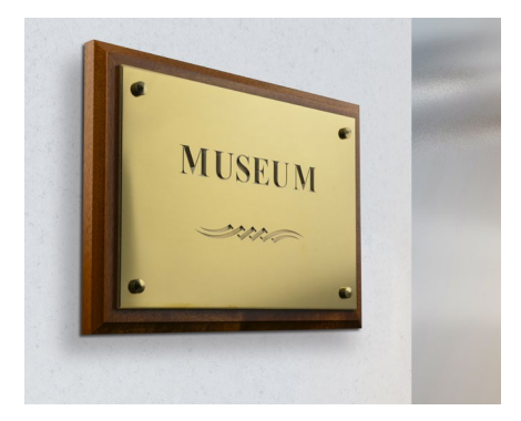
Professional and institutional plates