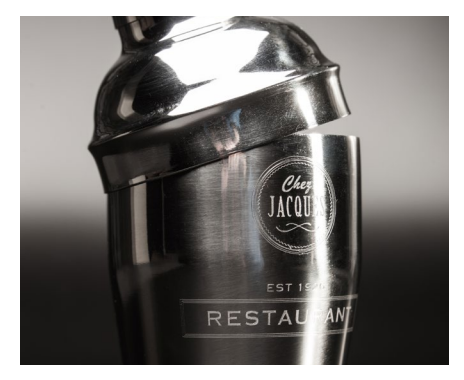
Gifts & personalization