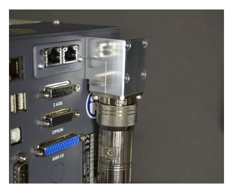
90° XCOM elbow connector