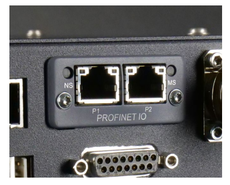
Fieldbus (Profinet or Ethernet/IP)