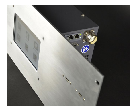
19" rack panel (4U)