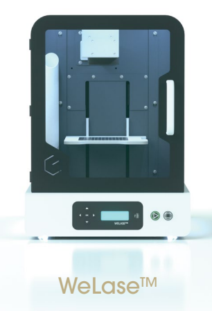
Gravotech's in-store laser engraver