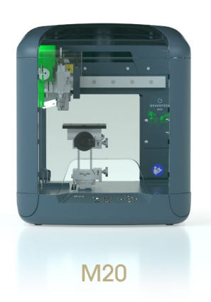
Gravotech's best selling engraver